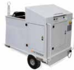
Mobile frequency converter 50/400 Hz, 10 - 40 kVA